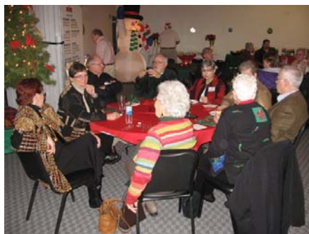
The happy chattering of people