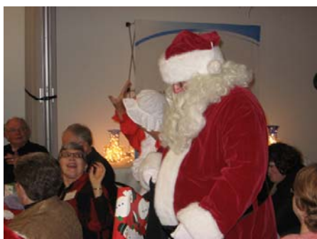
Santa and Mrs. Claus partying!