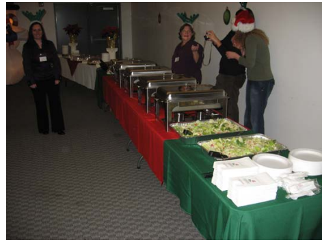
Favazza's Catering was delicious!