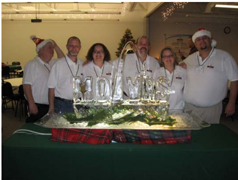
GSLAD Board and CSDVRS Team