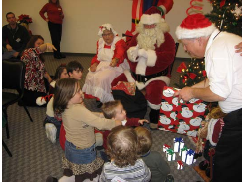
Santa giving presents to children