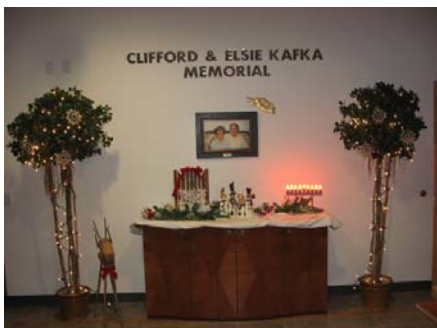
The lobby is in holiday cheer!